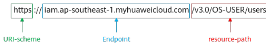
Figure 3-1 Example URI

https://iam.ap-southeast-1.myhuaweicloud.com/v3.0/OS-USER/users